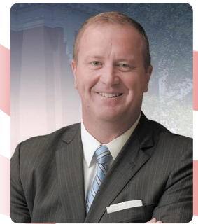
MO Attorney General Eric Schmitt