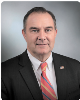
MO Lt Governor Mike Kehoe