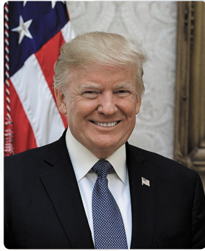
U.S. President Donald Trump